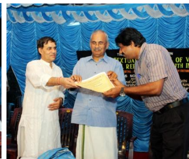
Distribution of Certificates

The full text of all the papers will be made available online shortly.