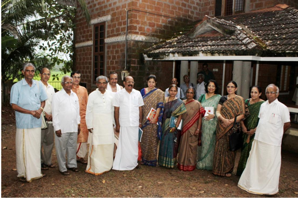
Dignitaries and participants at Seminar Venue

A three day National Seminar on Oral and Textual Traditions of Veda with special reference to South India was organized by the Indira Gandhi National Centre for the Arts, New Delhi and Kadavallur Anyonya Parishat, Kadavallur, Kerala in the precincts of Shri Ramaswami temple at Kadavallur from 14 th to 16 th November, 2014 under the aegis of Vedic Heritage Portal. The seminar was an academic precursor of a fortnight-long observance of the Anyonyam, a traditional Vedic pedagogical and ritual competition, unique to Kerala which takes place annually inside the said temple.